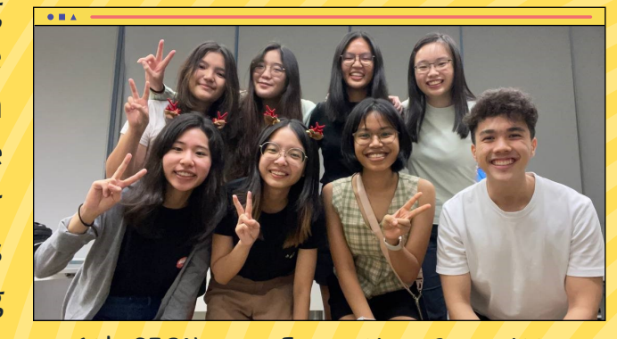
6th SIGNapse Executive Committee

this cause grew after I started learning sign language, and is now a sign language instructor. I was the Publicity Director in the Executive Committee where I led the publicity of the events we organised for students and public to increase awareness for the Deaf and hard-of-hearing community in Singapore.